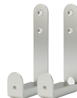
3 Sets of Mount Kits